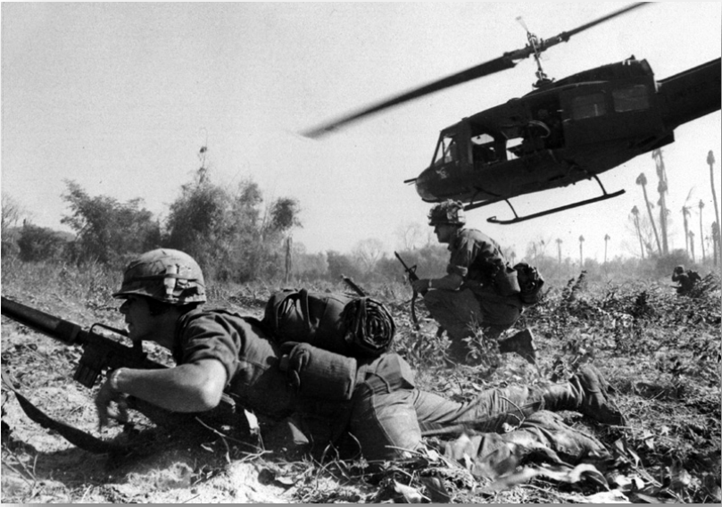
Ia Drang Valley, South Vietnam (public domain) (Figure 9)

weapons and strategy of fasting and prayer will help us to defeat him by keeping him pinned down, off guard, and distracted.